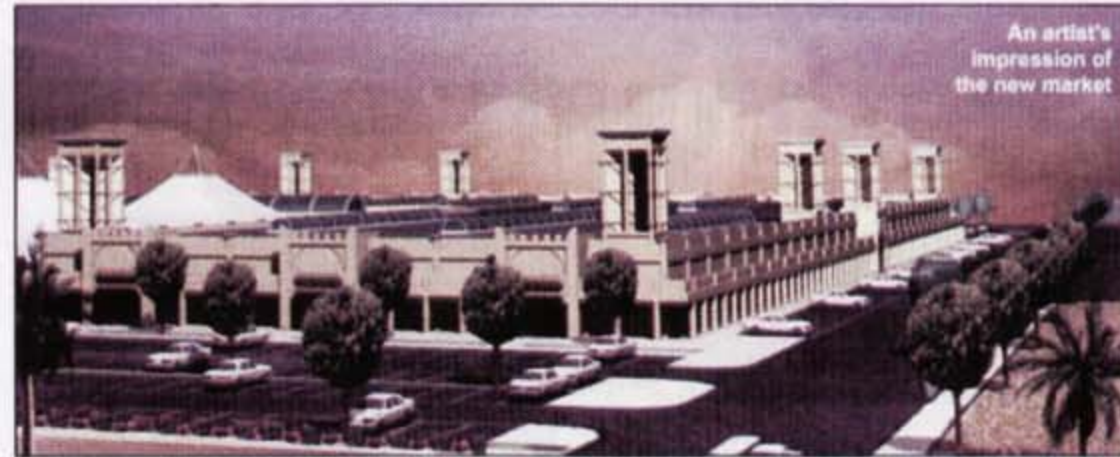
An artist's impression of the new market

The new plans by Emaar are designed to accommodate future expansions.